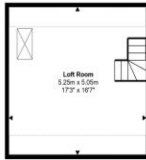
Second Floor Approx 27 sq m / 285 sq ft