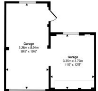
Garage Approx 33 sq m / 351 sq ft

This floorplan is only for illustrative purposes and is not to scale. Measurements of rooms, doors, windows, and any items are approximate and no responsibility is taken for any error, omission or mis-statement. Scale of items such as bathroom suite are representations only and may not look like the real items. Made with Made Guppy 360.