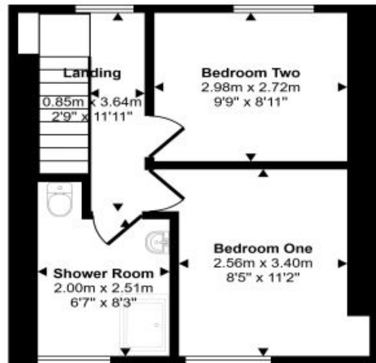
First Floor Approx 34 sq m / 367 sq ft

This floorplan is only for illustrative purposes and is not to scale. Measurements of rooms, doors, windows, and any items are approximate and no responsibility is taken for any error, omission or mis-statement. Icons of items such as bathroom suites are representations only and may not look like the real items. Made with Made Snappy 360.