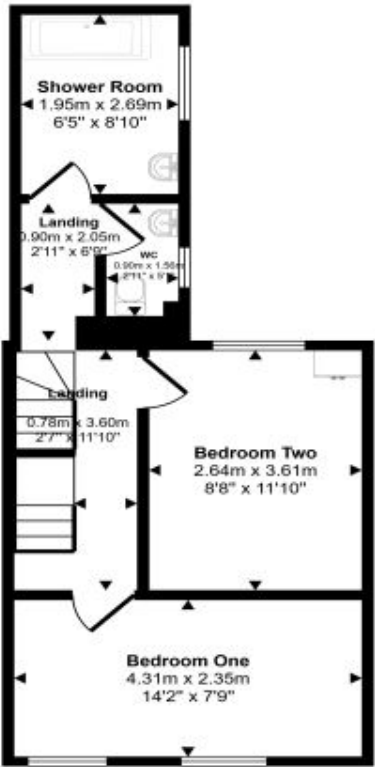
First Floor Approx 36 sq m / 388 sq ft