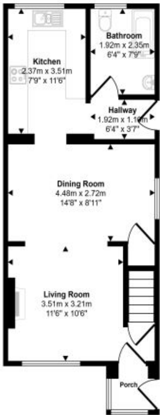
Ground Floor Approx 46 sq m / 493 sq ft

Approx Gross Internal Area 97 sq m / 1042 sq ft