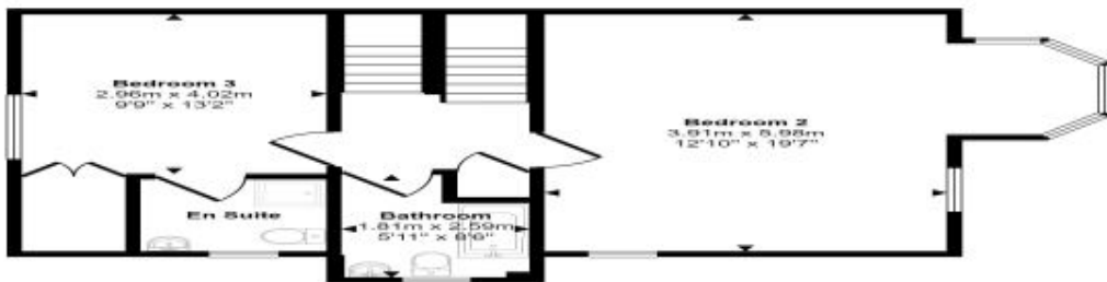
First Floor Approx 58 sq m / 624 sq ft