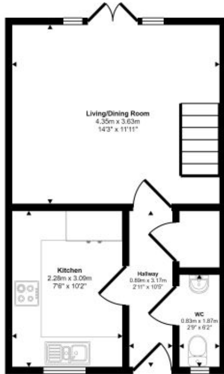
Ground Floor Approx 30 sq m / 322 sq ft

Approx Gross Internal Area 61 sq m / 653 sq ft