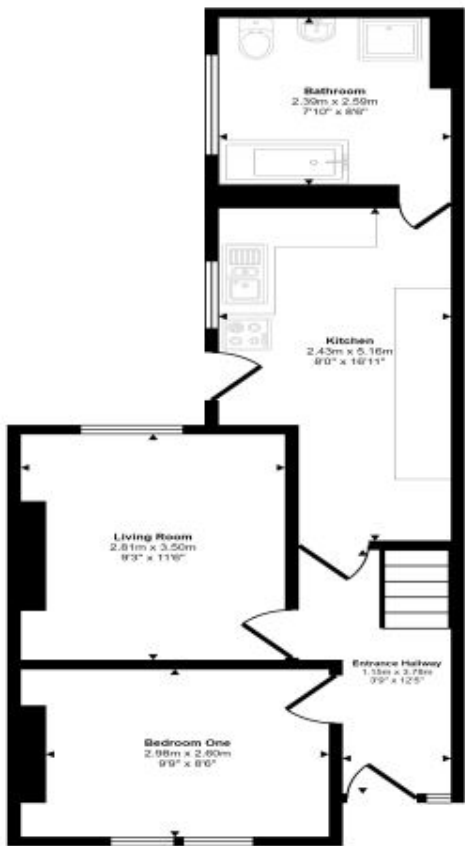
Ground Floor Approx 43 sq m / 459 sq ft

Approx Gross Internal Area 79 sq m / 852 sq ft