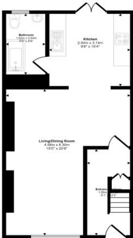
Ground Floor Approx 44 sq m / 472 sq ft

Approx Gross Internal Area 72 sq m / 777 sq ft