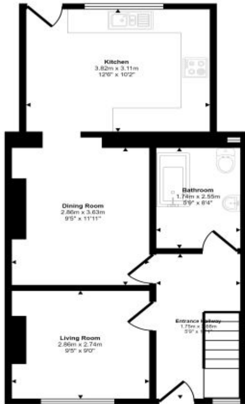
Ground Floor Approx 44 sq m / 478 sq ft

Approx Gross Internal Area 75 sq m / 806 sq ft