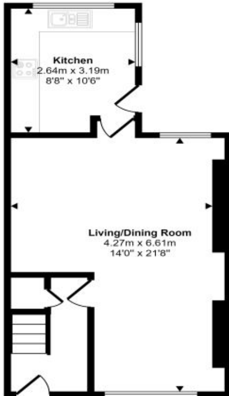
Ground Floor Approx 39 sq m / 418 sq ft

Approx Gross Internal Area 72 sq m / 771 sq ft