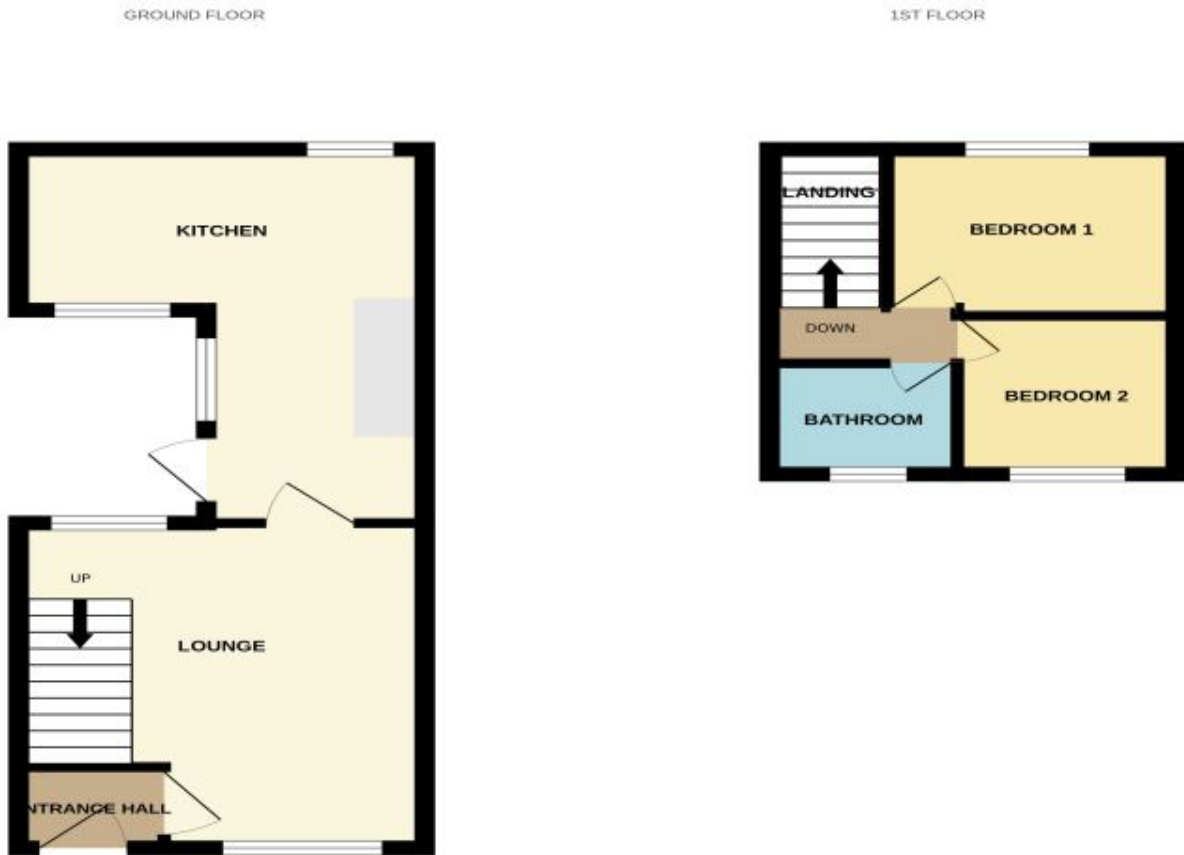
2 BEDROOM MID TERRACE HOME

Whilst every attempt has been made to ensure the accuracy of the floorplan contained herein, measurements of doors, windows, rooms and any other items are approximate and no responsibility is taken for any error, omission or mis-statement. This plan is for illustrative purposes only and should be used as such by any prospective purchaser. The services, systems and appliances shown have not been tested and no guarantee as to their operability or efficiency can be given. Made with MyFloorplan v2023